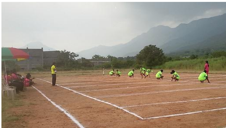
Kho-kho matches by Jupiter and Neptune