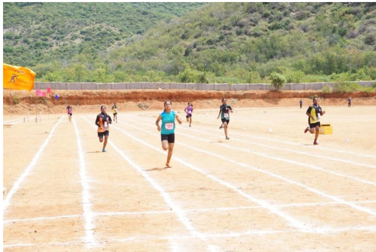
100mts race by our students