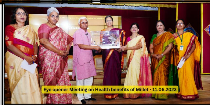
Eye opener Meeting on Health benefits of Millet - 11.06.2023