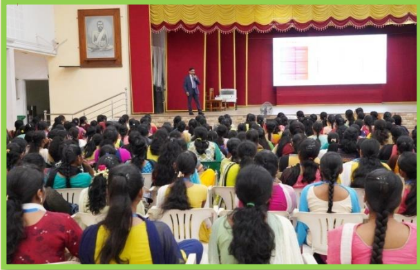
Pre-placement talk from CGI