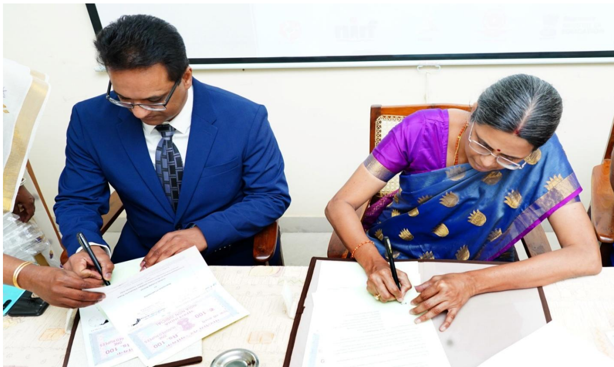
International MoU Signing between Avinashilingam Institute for Home Science and Higher Education for Women and SOEBIT Cyber Security – The Netherland, Europe