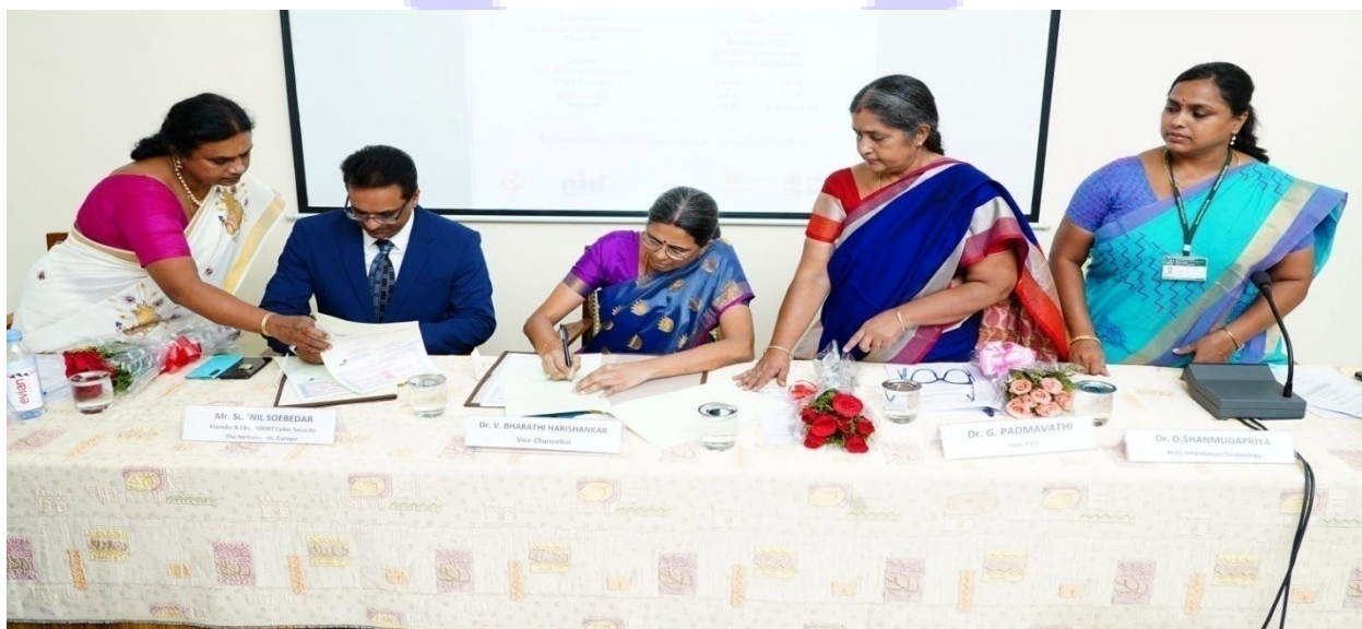
International MoU Signing between Department of Information Technology with Centre for Cyber Intelligence and SOEBIT Cyber Security