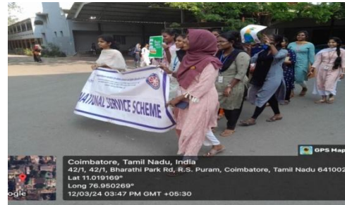
Voter Awareness Rally