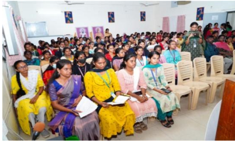
Seminar on Voter Awareness