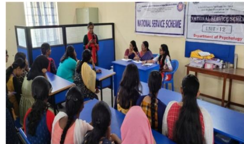
Voter Awareness Music Competition