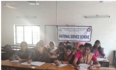
Voter Awareness Essay Writing