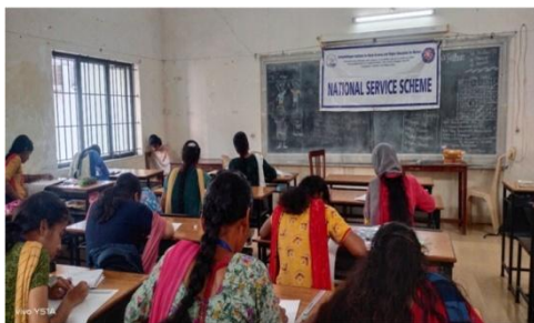
Voter Awareness Drawing Competition