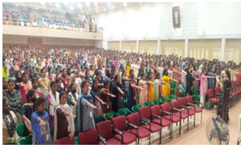
Voter Awareness Pledge