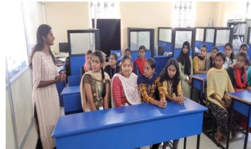
Voter Awareness Debate Competiton