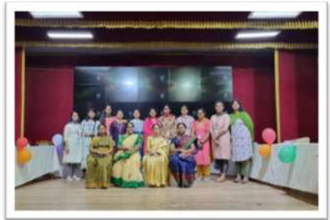
WINNERS OF THE EVENT