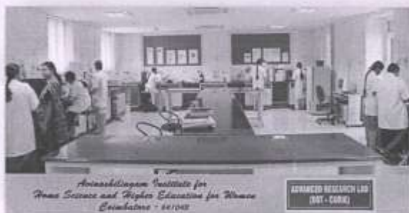
Advanced Research Laboratory