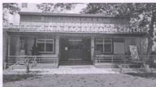
Prof. C.N.R. Rao Research Centre