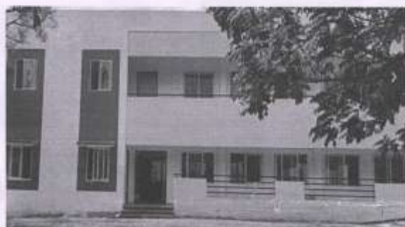
Centre for Machine Learning and Intelligence