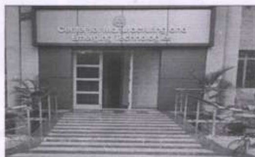
Centre for Manufacturing & Emerging Technologies