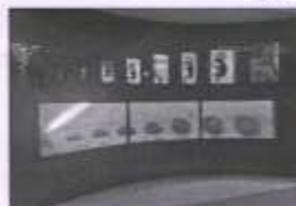
14-16 Feb 2022 NAAC Research Presentation