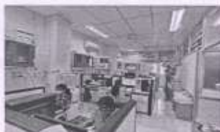
22-Aug-22 Business Lab