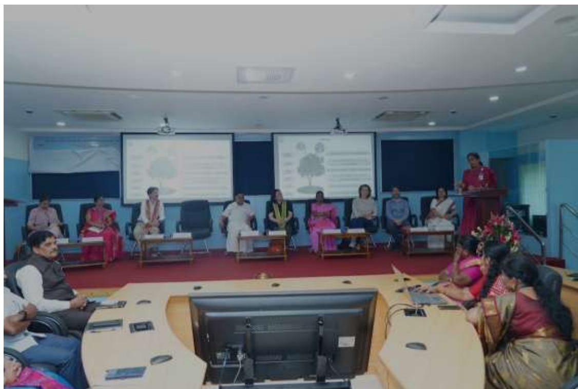
Fostering Academic Collaboration: US Delegation Visit on 31.01.2024